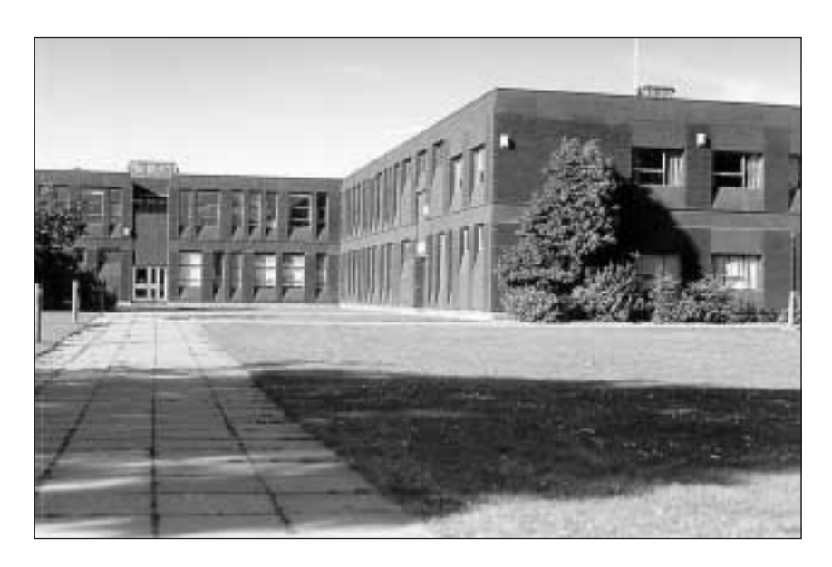
KING GEORGE V COLLEGE 1984