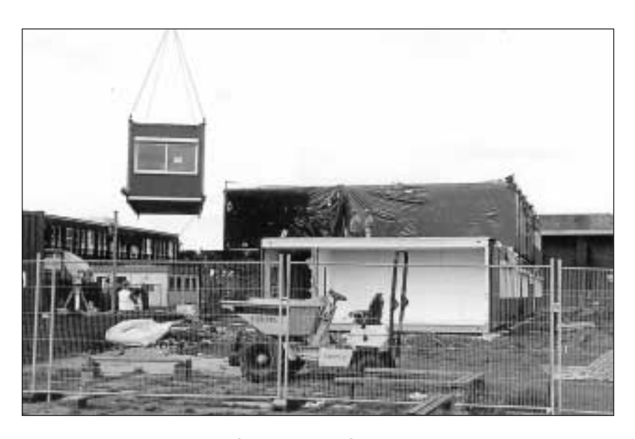
MORE BUILDING IN 2000