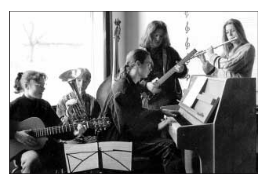
MUSIC AT KGV