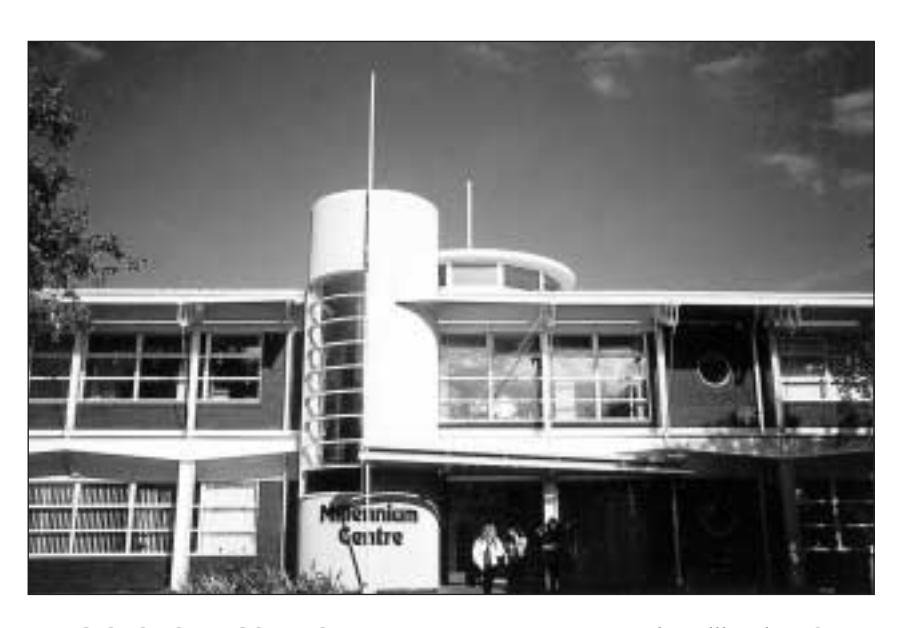
KING GEORGE V COLLEGE 2000