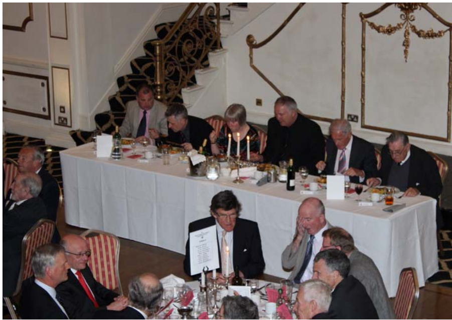
The Head Table