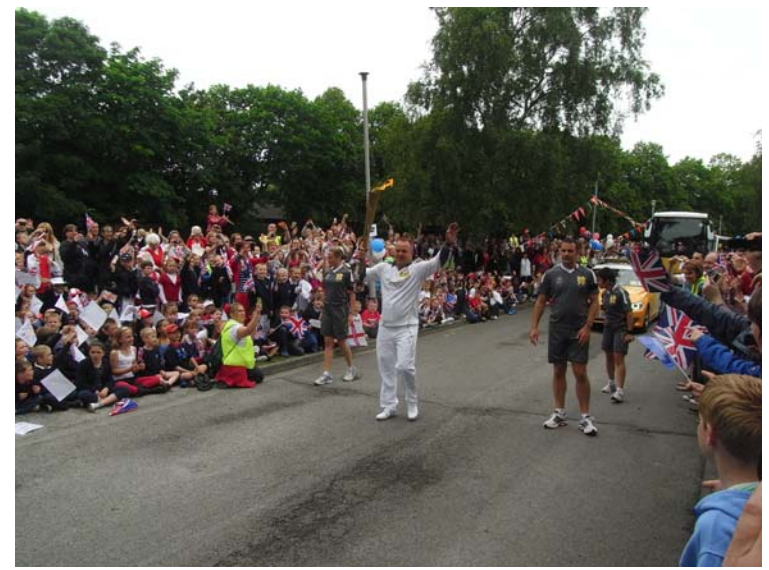
Local schools lined the roads around the College, cheering on 'the torch'.