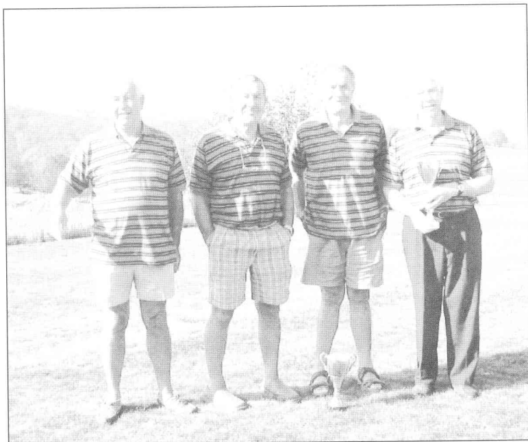
Truison Valley Champions 2005 (In O.G.shirts of course)