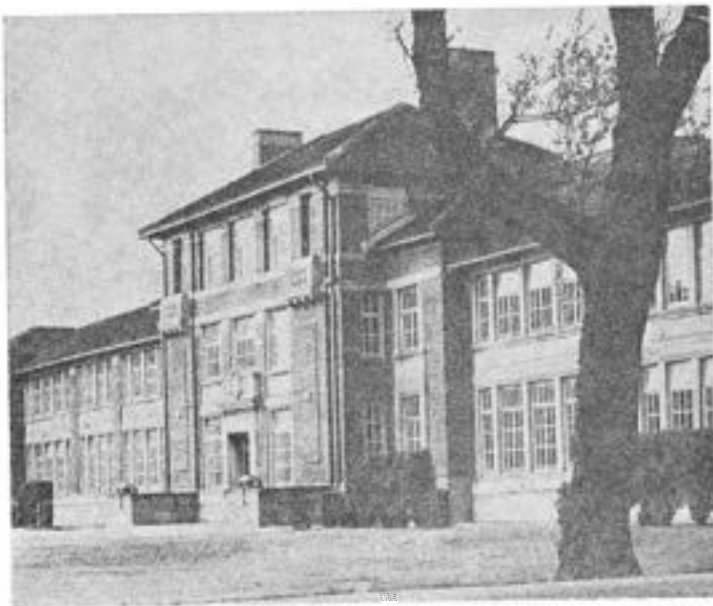
KING GEORGE V SCHOOL

was solved by deciding to provide comprehensive schools to cover the age range 11—16 and turn K.G.V. into a Sixth Form College.